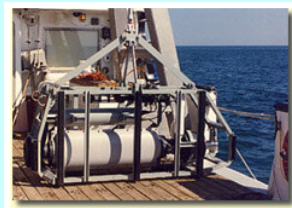
The HIDEX profiling bathyphotometer used for measuring bioluminescence